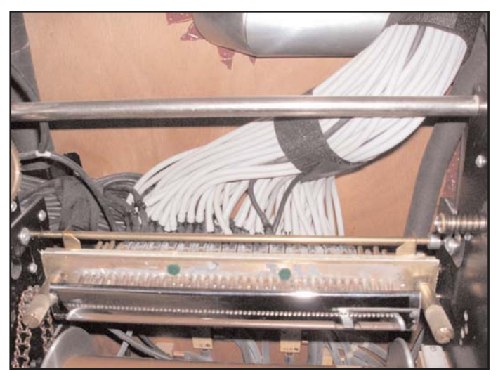
Figures 4 (above) and 5 (below). Close-ups detailing the connection from the newly installed valves to the tee behind the tracker bar.

states that these diodes are not necessary, I chose to put them across the coils anyway. As far as I can tell, the valves I used are no longer available, but a good alternative is the valve from Peterson Electro-Musical Products<sup>5</sup>. In the valve box, the felt on the valve works against a short length of brass tubing<sup>6</sup>, the other end of which can be directly connected to the tubing running to the tee behind the player roll bar ( Figures 4 & 5 ).