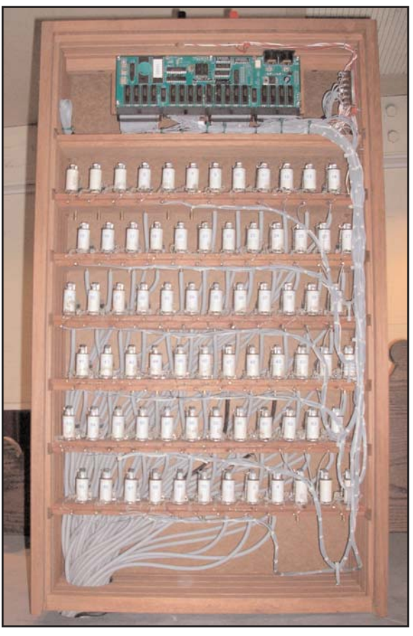
Figure 2. The box of valves for the organ.

Because of where the band organ is situated, it was very inconvenient to turn it on/off and change rolls. I decided to look into controlling it with a computer. Over 1200 Wurlitzer 165 songs have been converted to MIDI files from Wurlitzer rolls. These songs are available for around $5 per song (depending on quantity ordered)<sup>1</sup>. I found that the tempo of most of the songs is a little faster than I like, so I adjusted the tempo using standard MIDI software. Other than that, most of the songs are ready to go.