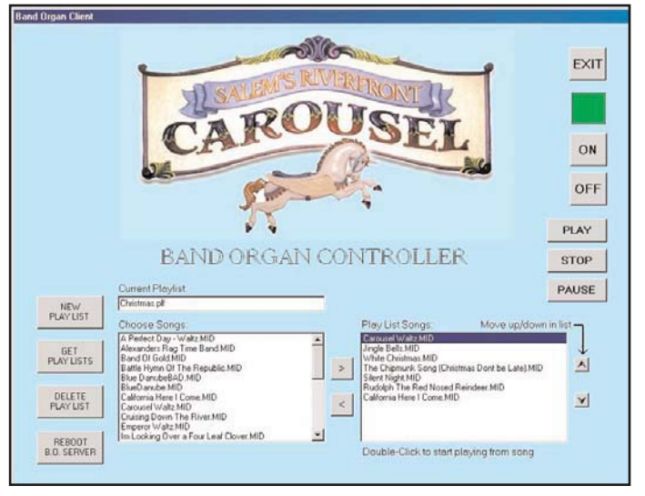
Figure 6. The Windows computer "client program."

As I am a computer programmer, I decided to write programs to play the MIDI files, rather than use something that wasn't specifically intended for this use. I have written two programs: a server program that runs on a Windows computer that is inside the band organ, and a client program ( Figure 6 ) that runs on any other Windows computer in the network at the Salem Carousel. The client program, however, may also run on the computer in the band organ. I am making this set of programs available for a charge<sup>7</sup>. These programs will work with any MIDI-controlled mechanical device, as they are, essentially, a MIDI "jukebox."