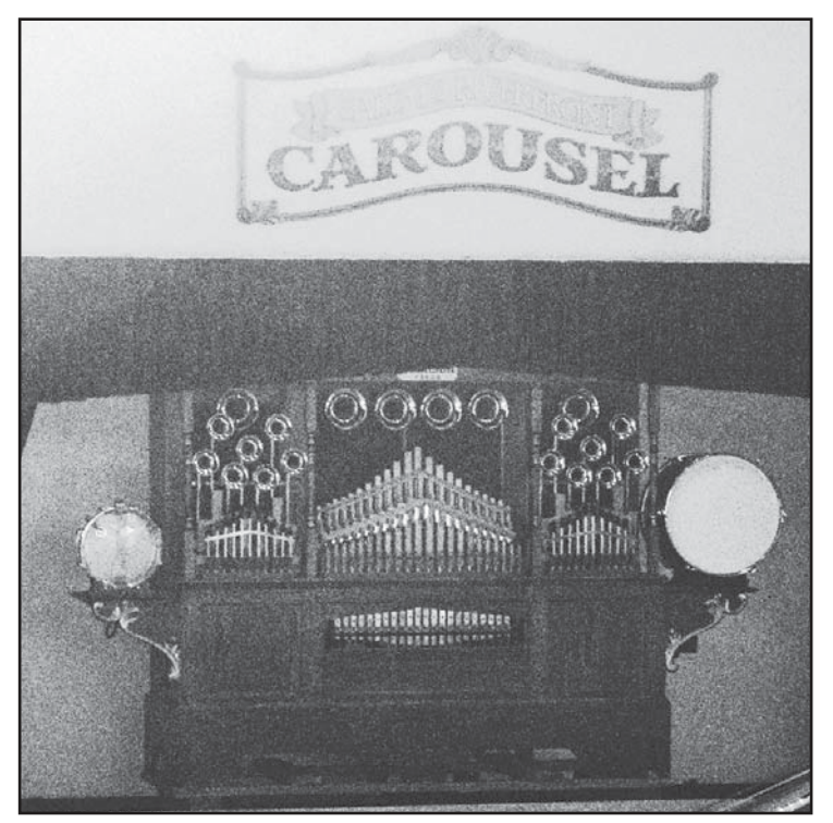
Figure 1. The Johnson 163 organ as seen on the loft of the carousel.

This band organ is at the Salem Riverfront Carousel in Salem, Oregon. It is a Johnson 163 which is based on a Wurlitzer 165 Band Organ. The band organ is situated in a loft that is about 12 feet from the floor and is not easily accessible. The picture of the band organ ( Figure 1 ) that I have is very poor quality, as the picture had to be taken at Christmas time, when a lift (used for decorating) was available to both get far enough away, and above the Carousel. There isn't much light during the Christmas season in Oregon.